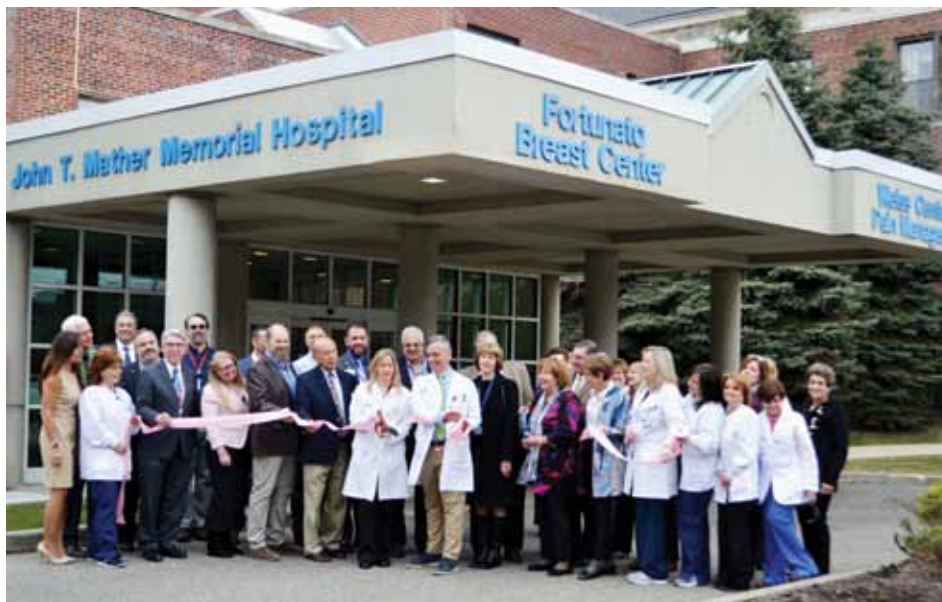
Fortunato Breast Health Center staff, Mather Hospital administrators, board members, employees and supporters gathered for the ribbon-cutting for the new 3D mammography units.

Women receiving their annual mammograms will now have even more accurate screenings thanks to two new state-of-the-art 3D mammography units at the Fortunato Breast Health Center.