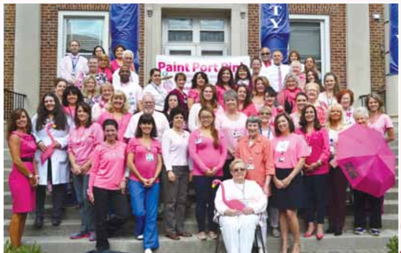
Mather Wear Pink Day