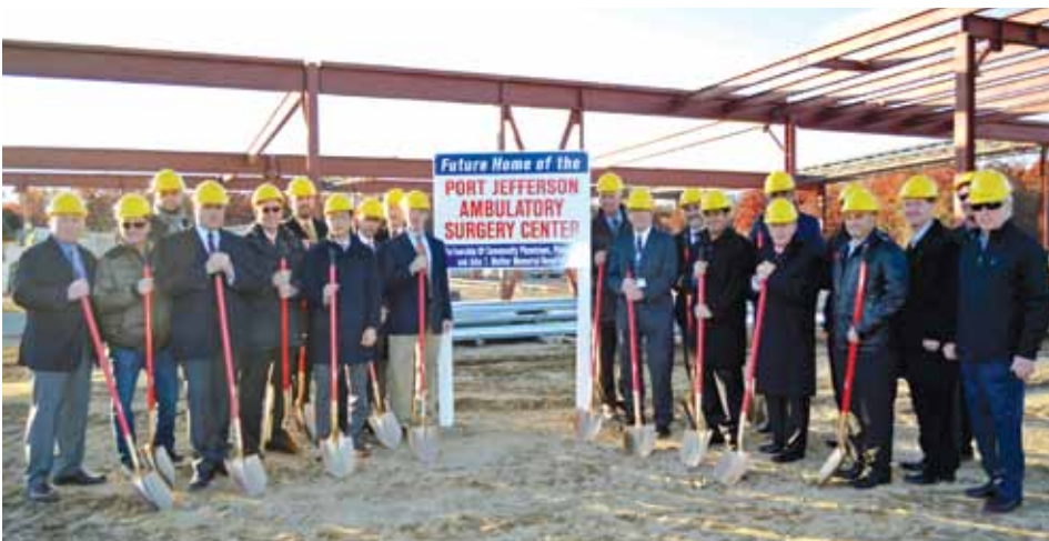
Some of the 19 community surgeons and Mather Administration attended the recent groundbreaking for the Port Jefferson Ambulatory Surgery Center.

A group of 19 community surgeons in partnership with Mather Hospital and Pinnacle III, a company that has developed ambulatory surgery centers nationwide, will open the freestanding Port Jefferson Ambulatory Surgery Center in Port Jefferson Station. A groundbreaking ceremony