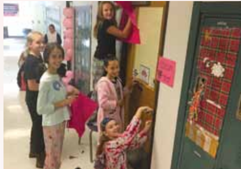
Port Jefferson Middle School Students