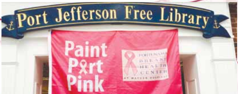
Port Jefferson Free Library