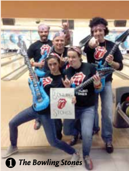
1 The Bowling Stones