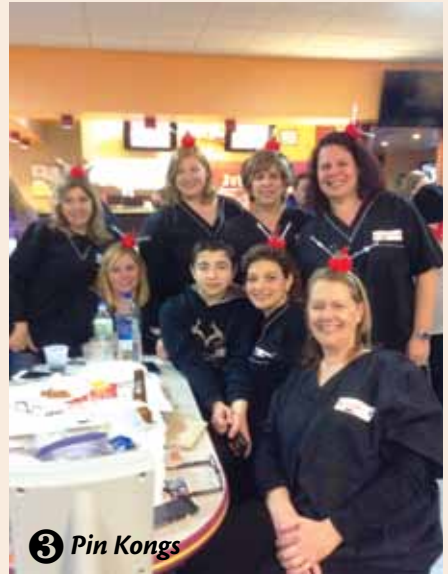
3 Pin Kongs