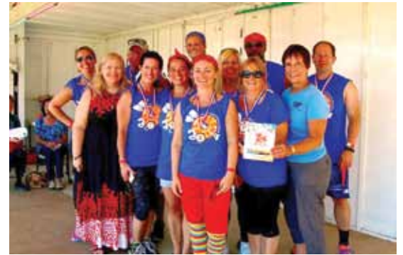
Congratulations to the six Mather teams that competed in the Dragon Boat Festival Races.