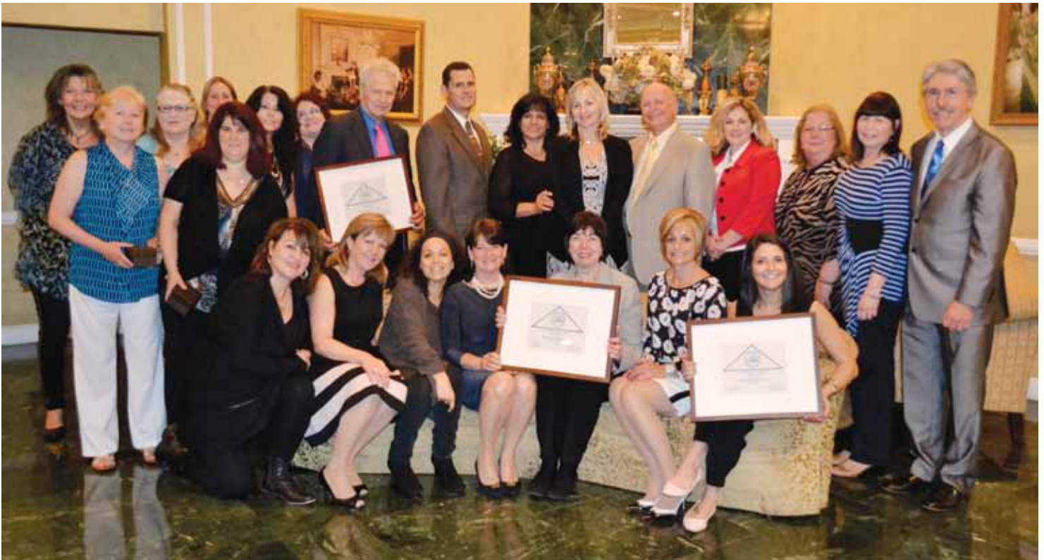
The Capstone Award was presented to Behavioral Health Services for being the leader in adolescent and adult behavioral services in the region. Their outstanding continuum of care has helped thousands of patients and families.