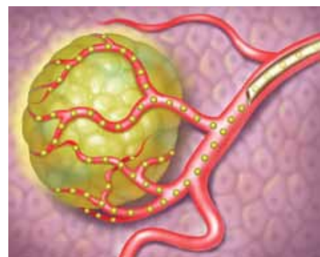
Radioactive microspheres are introduced by catheter to blood vessels feeding the tumor.

The Y-90 procedure, also known as SIRT (Selective Internal Radiation Therapy), is a minimally invasive procedure that combines radiation therapy and embolization (cutting off blood supply to a tumor through the introduction of a catheter into a blood vessel) to treat both primary and metastatic liver cancer. It involves the deposition of microscopic radioactive spheres that are delivered directly to the tumor site through a catheter using radiographic guidance. The microspheres contain the radioactive isotope yttrium-90 (Y-90) and selectively